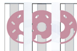
* Example of 3 stripes, the grey areas in the center of each image is combined to form the final composite image

Quality control that enables an automatic rescan of a slide when the system detects image quality issues resulting from a tilted slide or tilted tissue. Streamlines the user's workflow as the user does not need to interfere to trigger a rescan – which allows users to save time by not re-preparing or readjusting slides, thus reducing labor hours (labor cost savings).