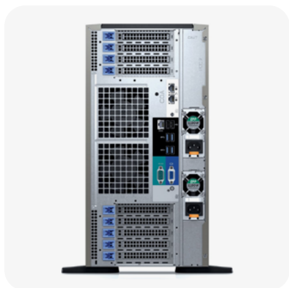
Keep working: Fault-tolerant architecture includes mirrored drives and dual power supplies

The highly resilient ADVANCE system features enterprise-level Redundant Array of Independent Drives (RAID) technology, built-in redundancy and automatic data duplication to safeguard laboratory and patient data.