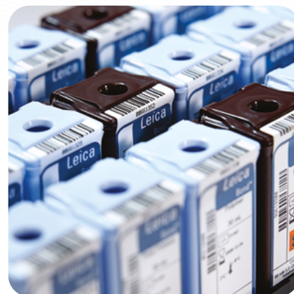
Share reagents and protocols among all instruments to reduce stock levels