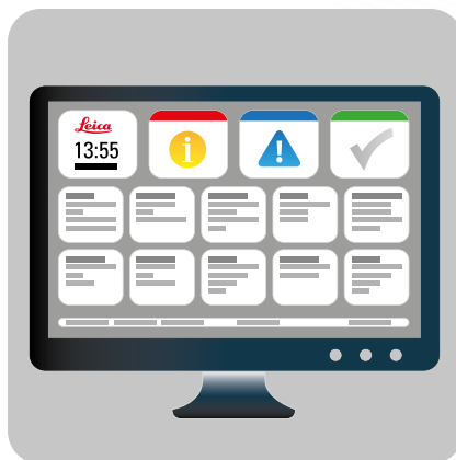
BOND-ADVANCE Dashboard: See the real-time status of each instrument on your network