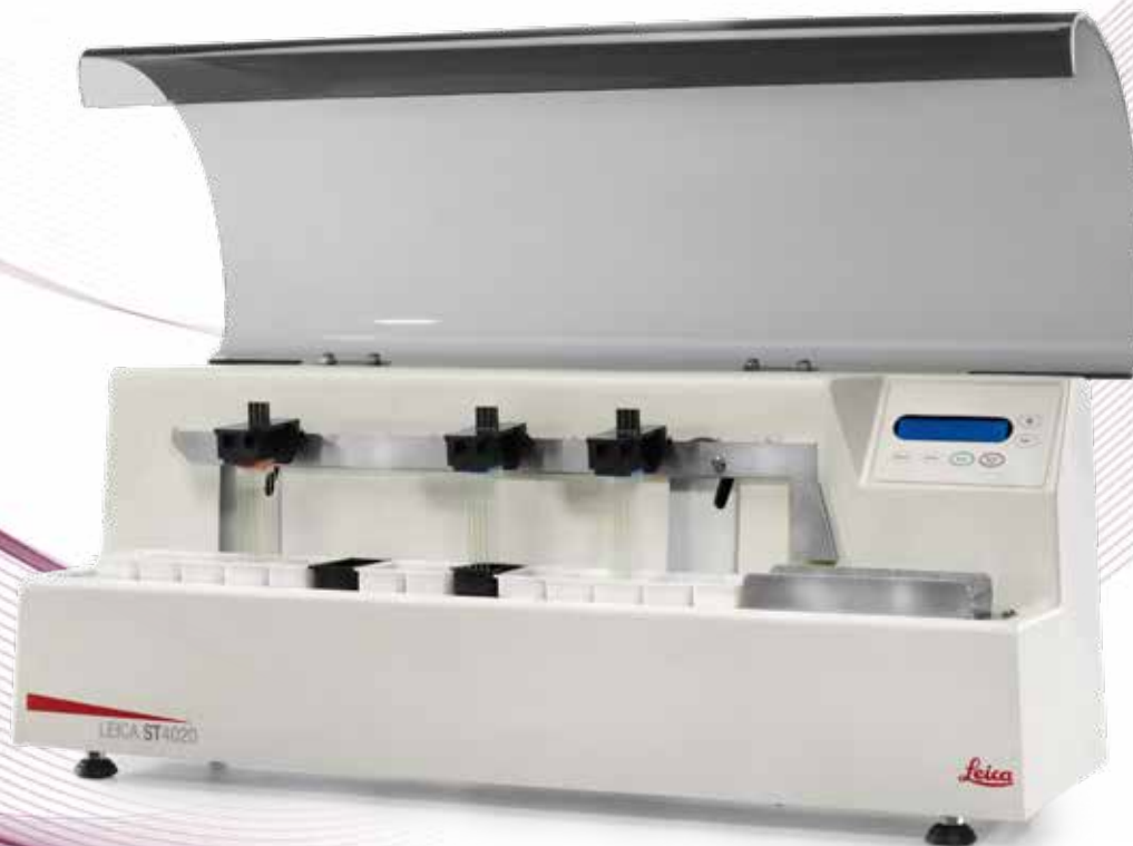
1 Leica ST4020 linear stainer with optional hood