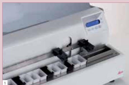
1 Collection tank for 16 slides

Technical specifications subject to change. The Leica ST4020 linear stainer has been designed and manufactured in compliance with UL requirements and carries the UL approval symbol.