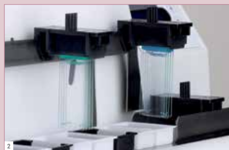
2 Four-slide racks, four slides per slide carrier/rack